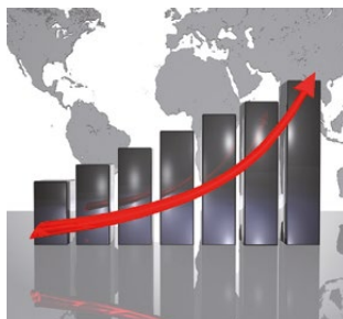
Marketing & Sales